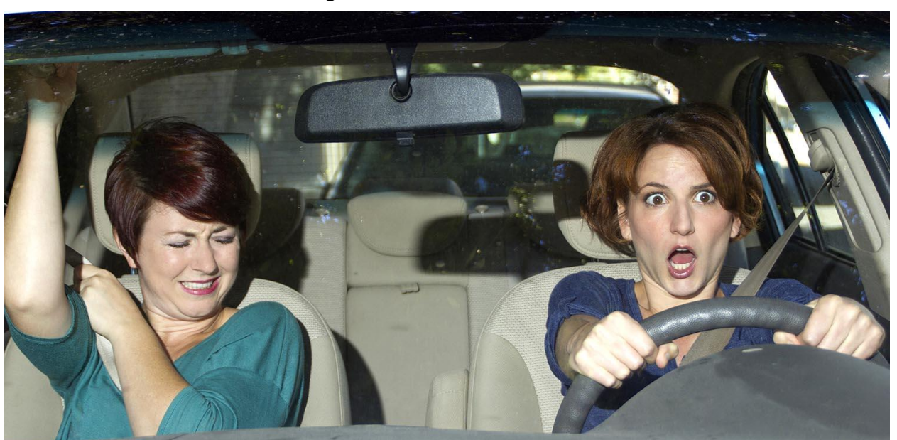
Case 2: Fatal Accident and Wrongful Death Claim